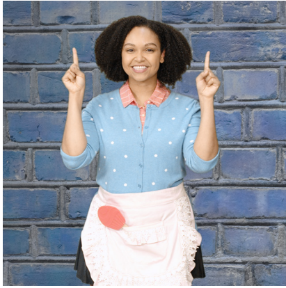
"Trust in the Lord